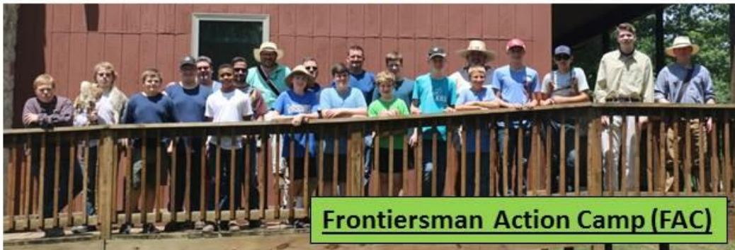
Frontiersman Action Camp (FAC)