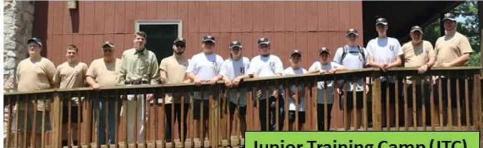
Junior Training Camp (JTC)