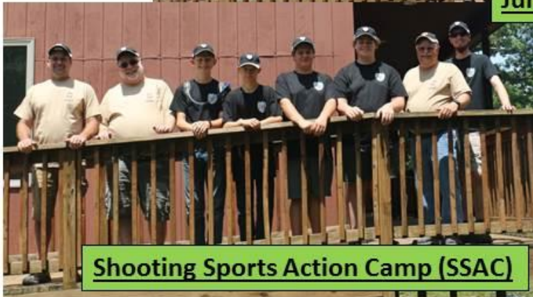
Shooting Sports Action Camp (SSAC)