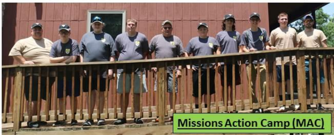
Missions Action Camp (MAC)